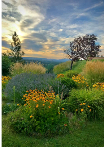
Photo: Fairmount Memorial Park gardens at sunset